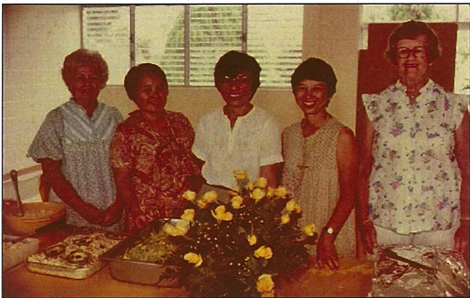
FOOD SERVERS AT ANNIVERSARY