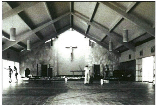
INSTALLATION OF NEW TILE FLOOR