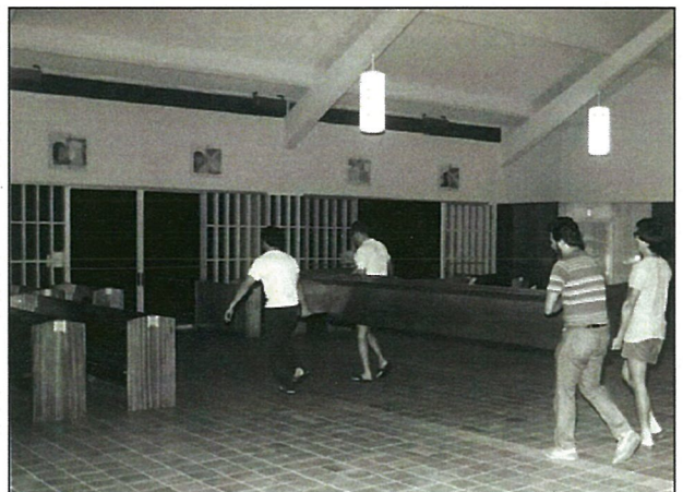
RESTORATION OF CHURCH PEWS