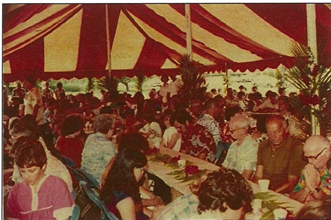
ANNIVERSARY POT LUCK DINNER