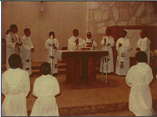
FEAST DAY MASS