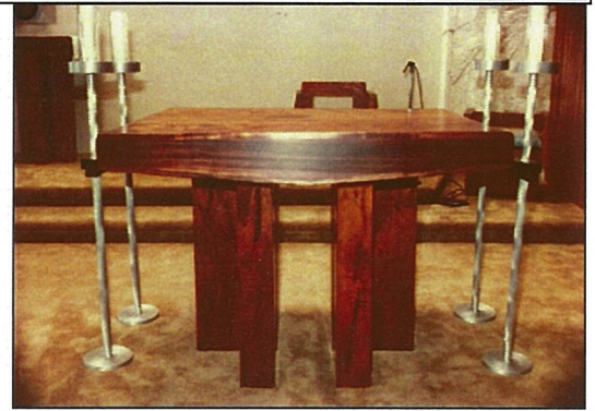
NEW FURNITURE FOR CHURCH