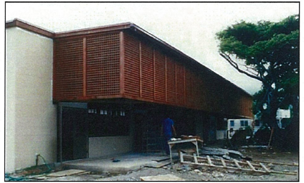
CONSTRUCTION OF PARISH HALL