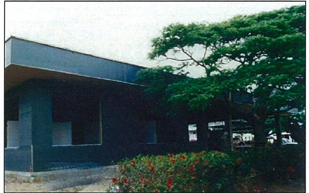
BUILDING OF PARISH CENTER