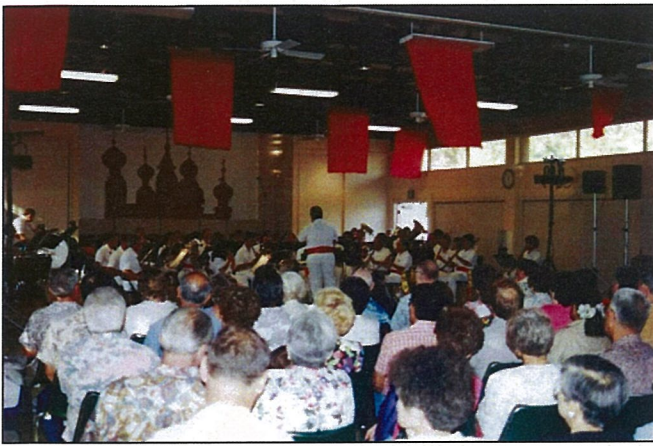
RUSSIAN RHAPSODY CONCERT