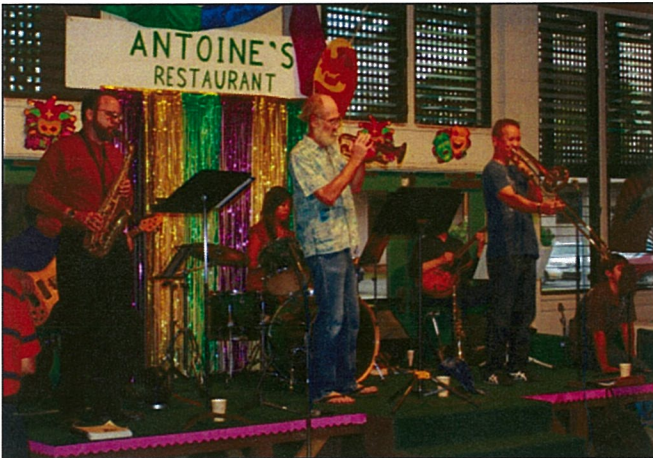
MARDI GRAS PARTY