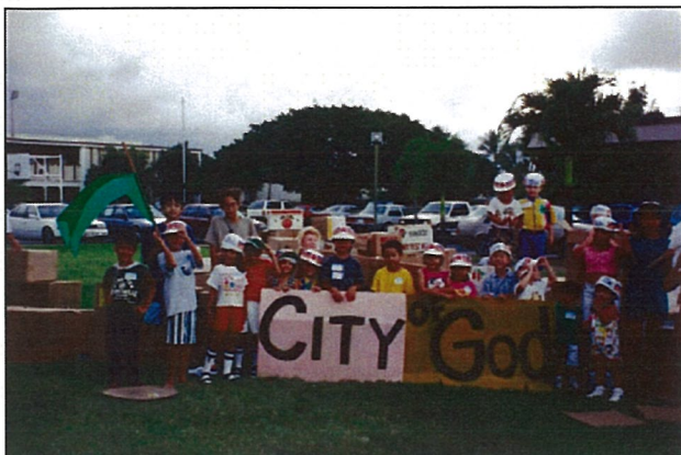
33RD ANNIVERSARY POTLUCK DINNER