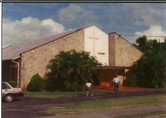
EXTERIOR OF CHURCH