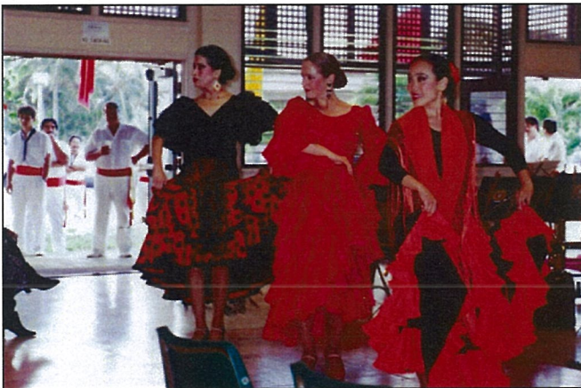
A NIGHT IN BARCELONA CONCERT