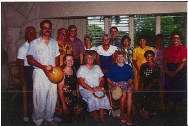
ST. JOHN VIANNEY CHURCH CHOIR