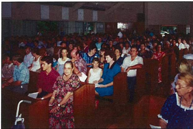
MASS CELEBRATING 30 YEARS