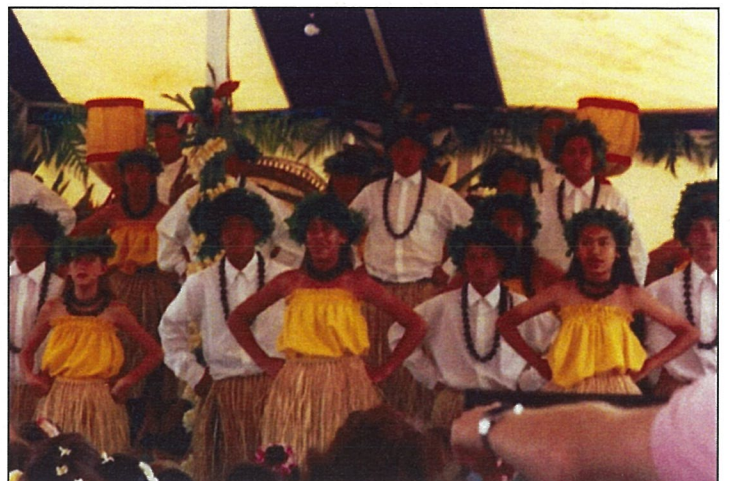
SCHOOL MAY DAY CELEBRATION