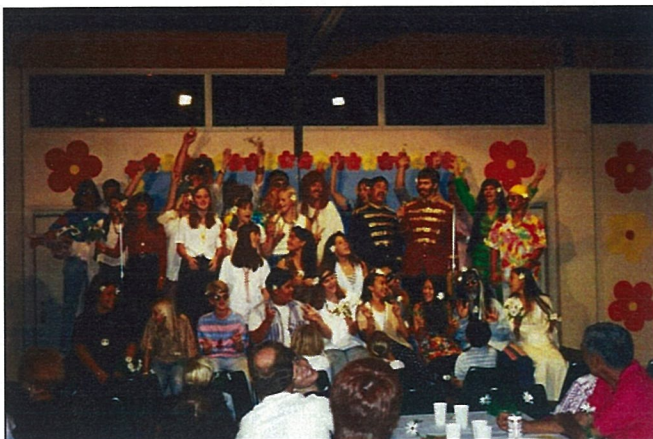
AGE OF AQUARIUS PARTY