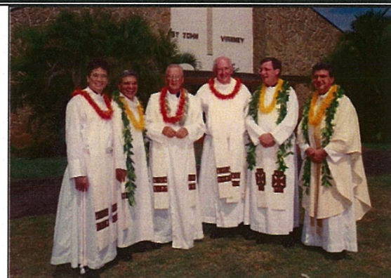
CELEBRANTS FOR ANNIVERSARY