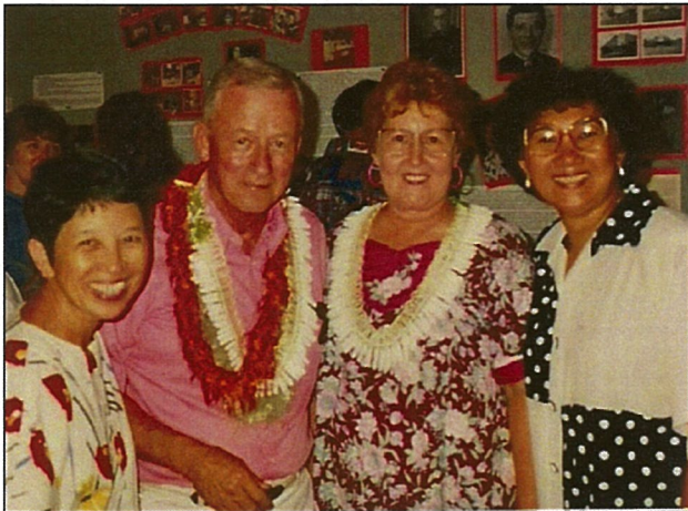
ADMIRERS OF THE "MEMORY WALL"