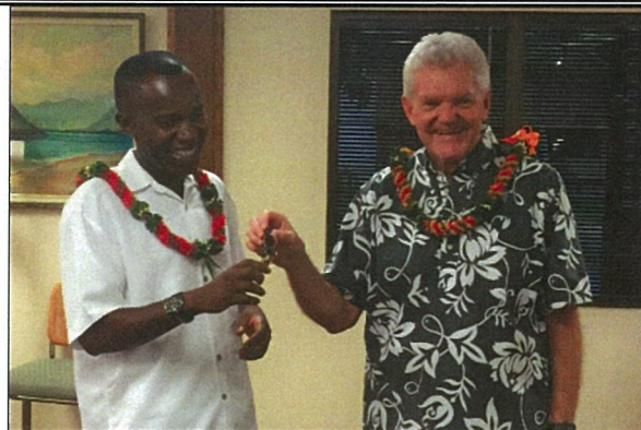
PASSING OF THE PARISH KEYS