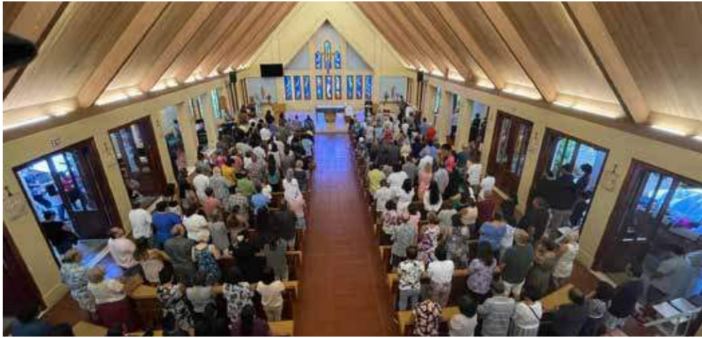
Mass in Sacred Hearts Church in Kapalua, a mission of Maria Lanakila