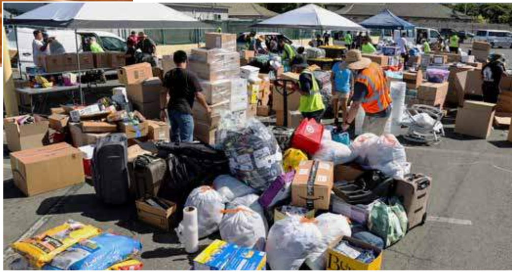
Goods and supplies collected for the Maui fires relief effort