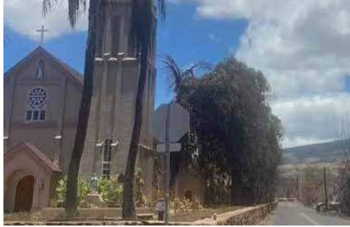
Maria Lanakila church still standing