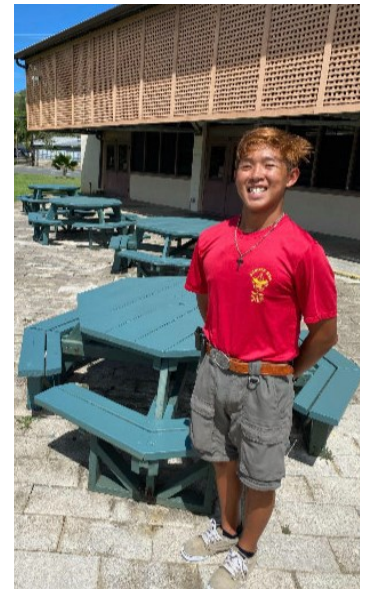
SJV School Donation Drive for Maui