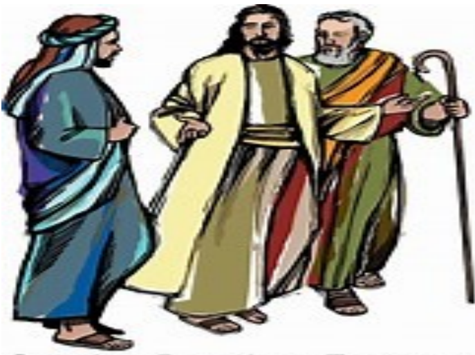
On the Road to Emmaus