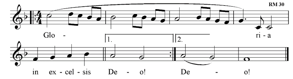
Daniel Laginya, © 1986, 2011 G.I.A. Publications, All rights reserved.